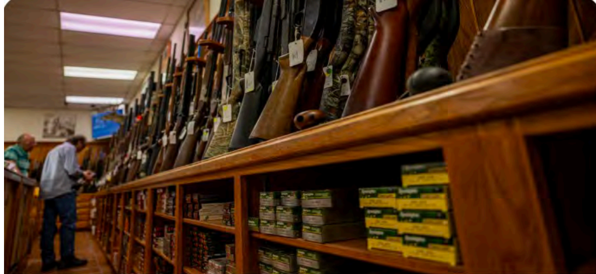
Biden Administration Proposes Expanding Background Checks on Gun Sales